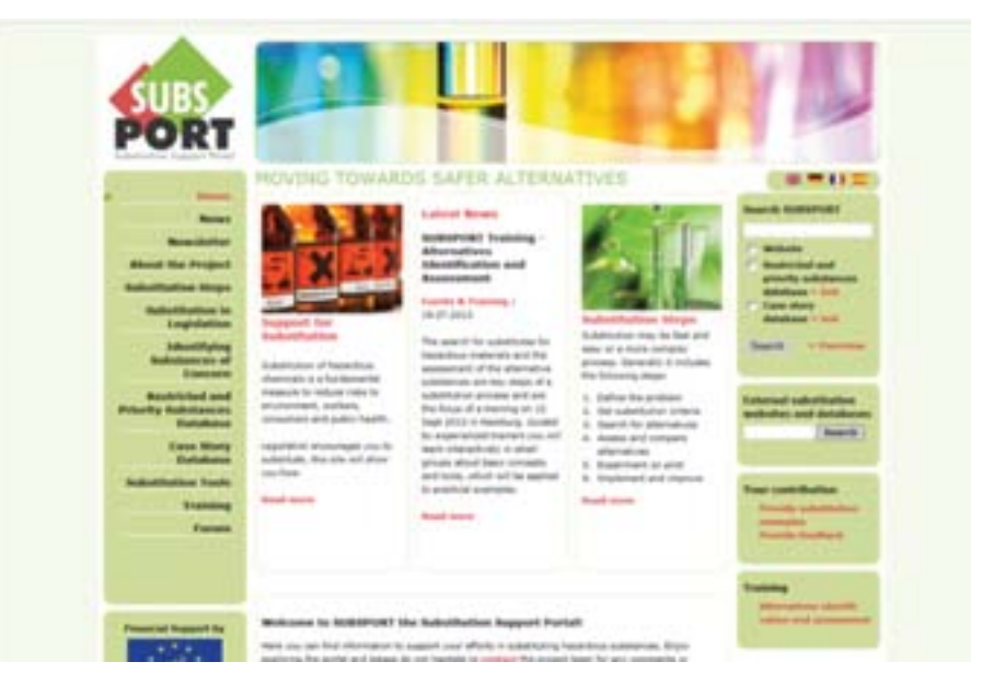
A screenshot of the SUBSPORT website

The goal of SUBSPORT, the development of which was funded by a multinational consortium of public-sector organisations, is to provide an internet portal that constitutes a state-of-the-art resource on safer alternatives to the use of hazardous chemicals. A particular aim of this OSH tool is to support companies of all sizes in fulfilling substitution requirements of EU legislation, for example those specified under the Regulation on Registration, Evaluation, Authorisation and Restriction of Chemicals (REACH). As