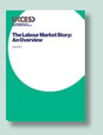
integration and employment insecurity.

Using a novel analytical framework for understanding how procurement shapes employment, this report presents the results of six case studies of outsourced cleaning services and draws out key implications for improving policy and practice. Each case study is reported in the form of a narrative that highlights the specific characteristics of procurement practices and employment conditions. In addition, key thematic issues are explored by comparing the results across the six cases. The themes consider pay, working time, skill and job design,