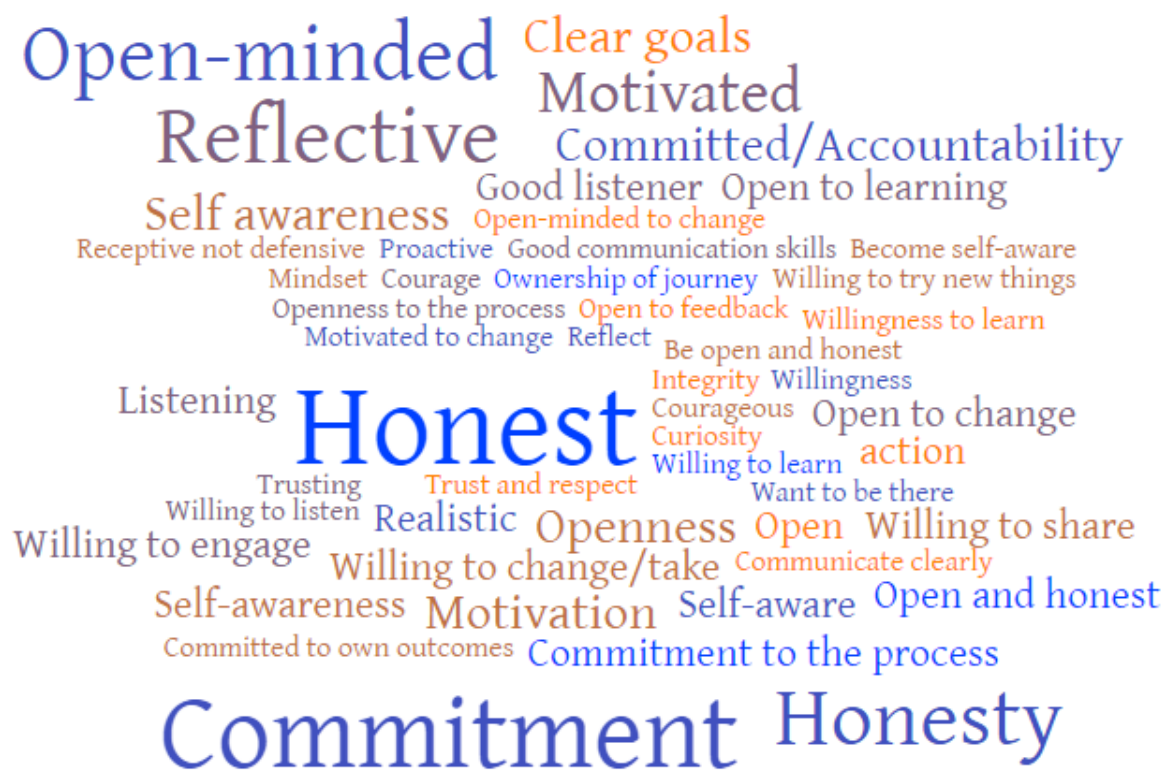
Figure 1: A word cloud of the top fifty responses on what coaches thought made a good coachee, (before they were coded).

Initially, it appeared that 'Honest' and 'Commitment' were the two most prevalent characteristics important to our participants, with a total of ten and nine responses respectively (see Figure 1, which shows the Top 50 responses). However, this was before items were coded and did not consider those with multiple clauses such as 'Willing and Engaged'. Accordingly, items with multiple clauses were recorded as two responses, as they contained more than one characteristic. As a result, there were 437 'responses' in total. Thus, whilst 'Honest' and 'Commitment' were popular words, which were directly used by participants, other themes made their way up the ranks later on in the analysis.